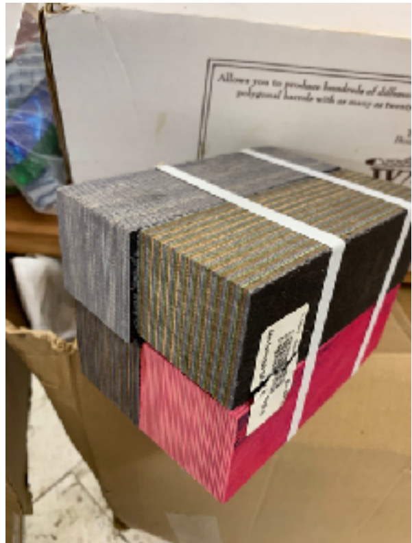
COLORED LAYERED WOOD BLOCKS