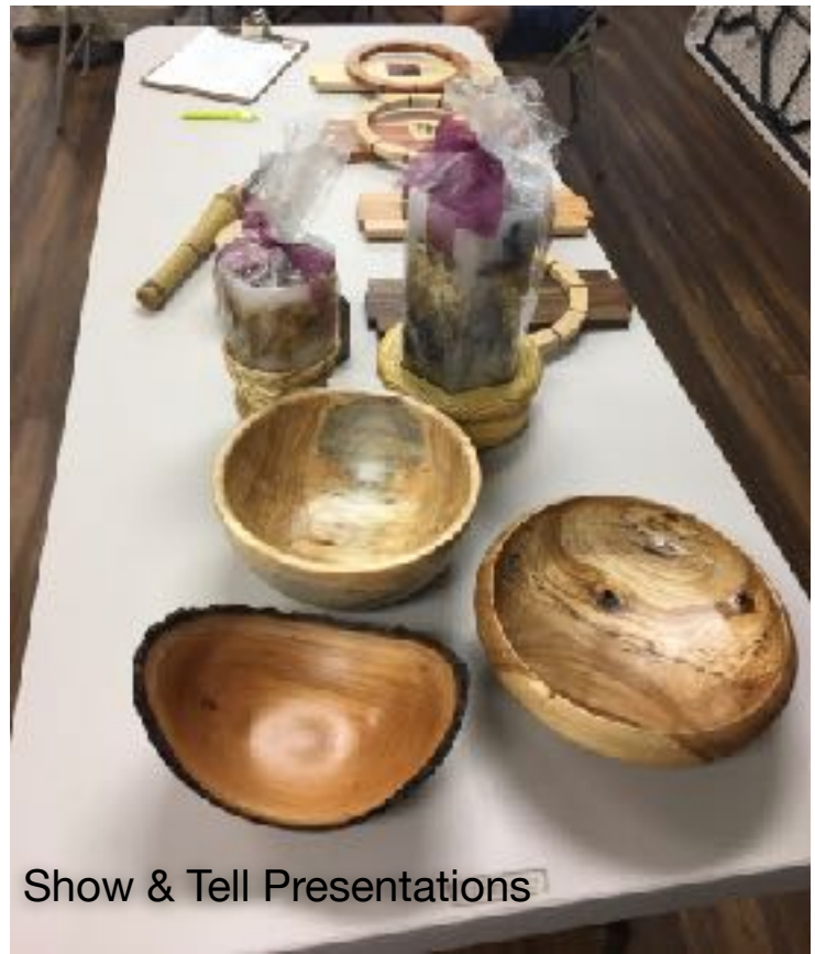
Show & Tell Presentations