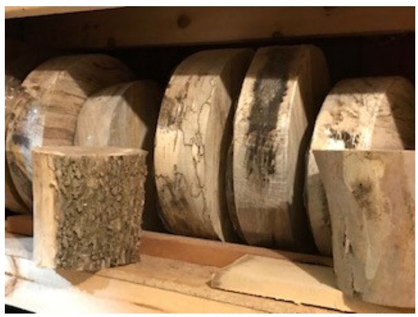
There is a separate room to store wood and blanks. Here are two pictures of how he's built shelving for the rounds.