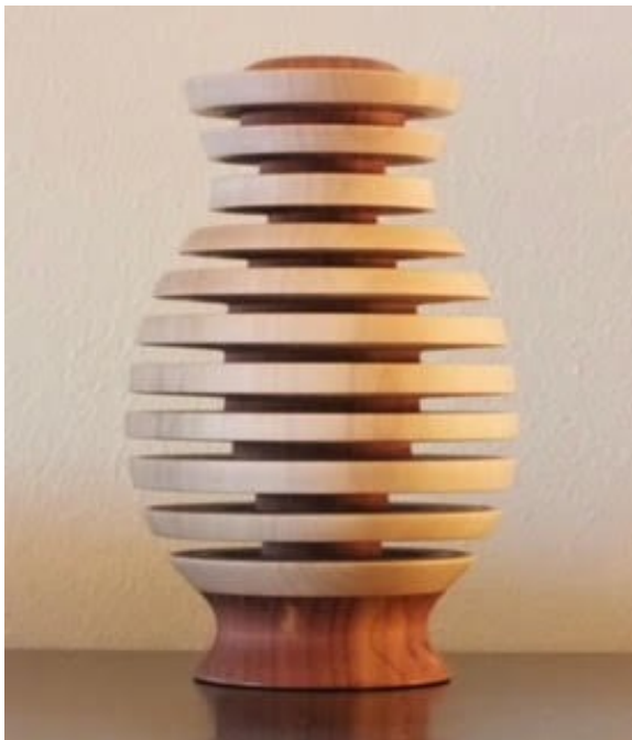
Ed Boiteau— Vase within a vase. Outside is maple and inside cedar. (6.5” x 4”). Finish is shellac with denatured alcohol.