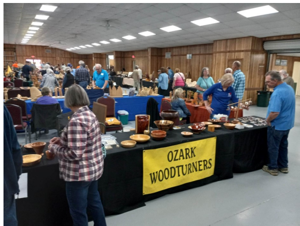
Ozark Woodturners tables at Carvers Show & Sale in May

This is a reminder of the club 2x4 challenge for the July meeting. Rules: 2x4 construction grade not to exceed 8 feet. Cut it, grind it, carve it, it, and use your imagination. 50% must be from the 2x4 and some parts must be turned. The club will award prizes.