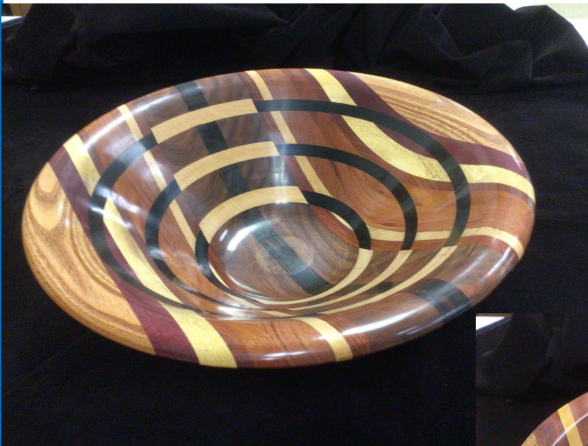
Bill Dorzok—Two ring bowls made from 6-7 types of wood. Note the difference in the rim of each—one is rolled and one flat. Finish is wipe on poly.