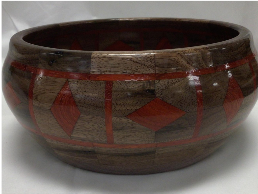
Wally Burr—Walnut and Paducah segmented bowl. Note how he changed the direction of the diamonds. Finish is CA glue.