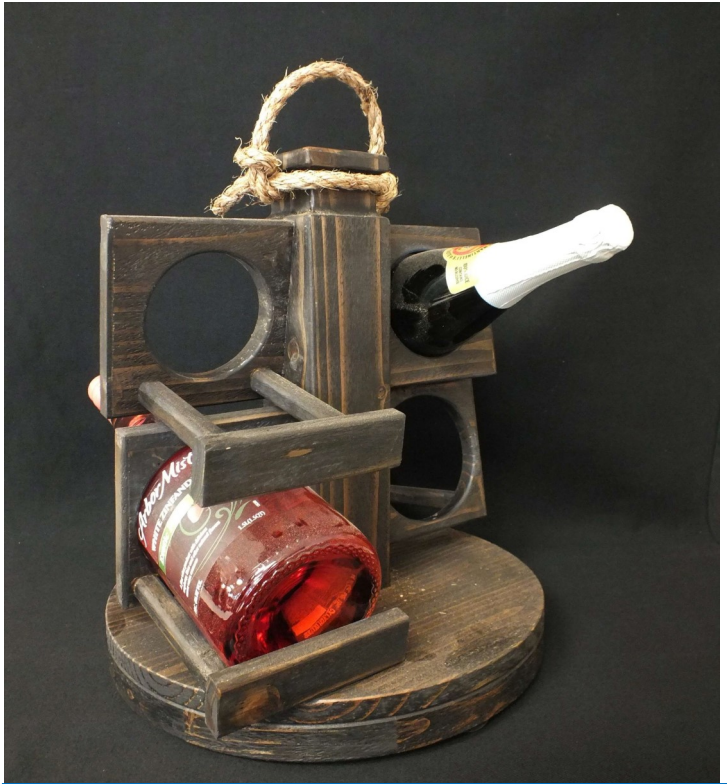
Bill Dorzok—Wine rack. Using lathe he turned feet, burrowed holes and formed base. He distressed the wood using a wire brush and an ebony stain. The finish is flat enamel.