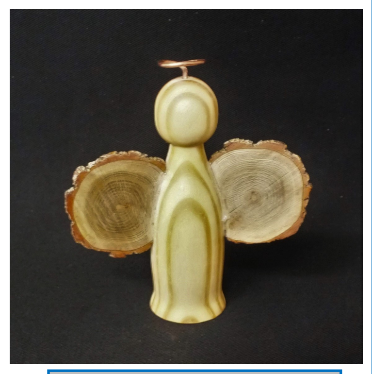
Linda Moore—2 x 4 Angel with Sassafras wings. Finish is wipe on poly.