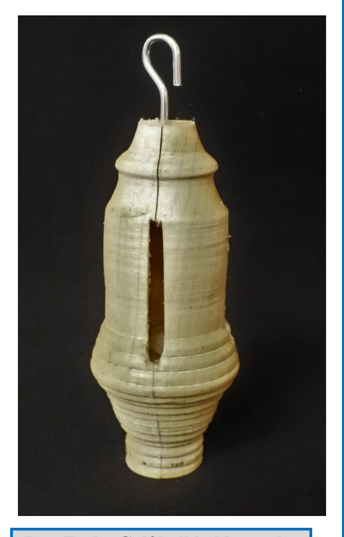
Ron Ezel—Golf ball holder and a Christmas tree hanger.