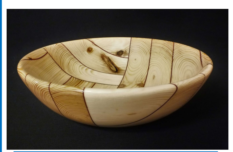
Steve Wagner—2x4 glued with orange card stock between them.