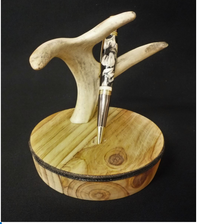
Terry Butler—Pen Display with Antler. Base is 2x4 with robe enhancing the top rim. The pen is made from Deer teeth embedded in acrylic.