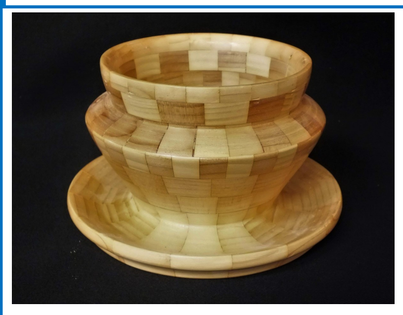
Doug Green -- 2 x 4 Segmented bowl and a segmented lamp. Finish is Mahony's finish with wipe on poly.