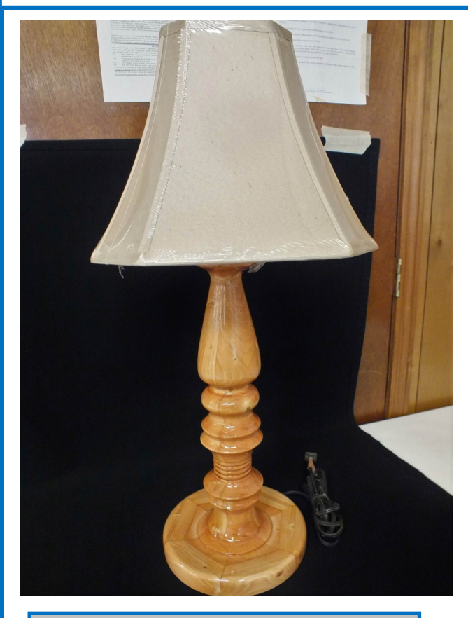
Dick Rickon—He used ALL of the 2x4 to build this lamp. Finish is 2 coats of MinWax Sealer and 3 coats of Krylon Urethane.