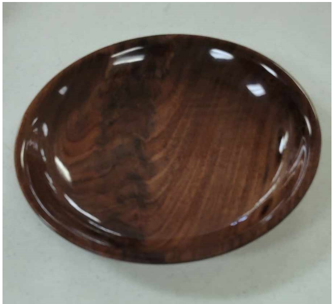
Steve Wagner—Feathered crotch of Walnut and a Spalted Hackberry. Finish is 6-8 coats of CA glue then 2 coats of O.B. Shine Juice (O.B. Shine is made of equal parts of Boiled Linseed Oil, Clear Shellac and Denatured Alcohol—apply with paper towel at high speed.)