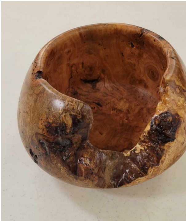
Erica Banza—Cherry burl finished with sanding sealer and friction polish.