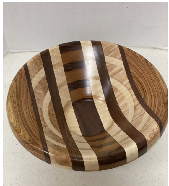
Bill Dorzok—Ring bowl made from Birdseye Maple, Walnut, Curly Maple and Cherry. Finish is 4 coats wipe on poly with a final finish of satin . Wall thickness is 3/8 inch.