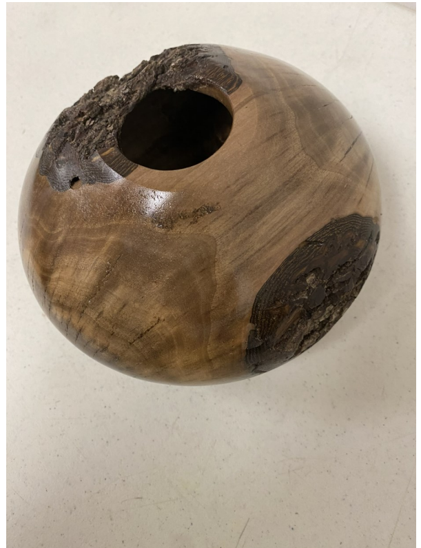
Erica Banza—Walnut hollow form with lacquer finish.