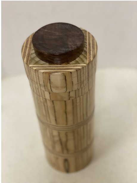
Bernie Martinson—Plywood fireplace match box. Finish is sanding sealer and six coats of spray on poly.