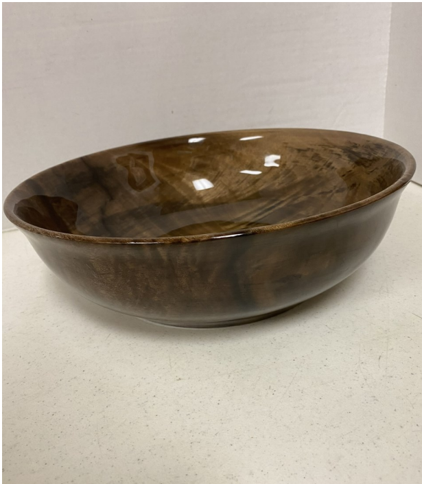
Dallas Hensley—Walnut bowl finished with epoxy. To dry the epoxy he used a device he built from a rotisserie oven.