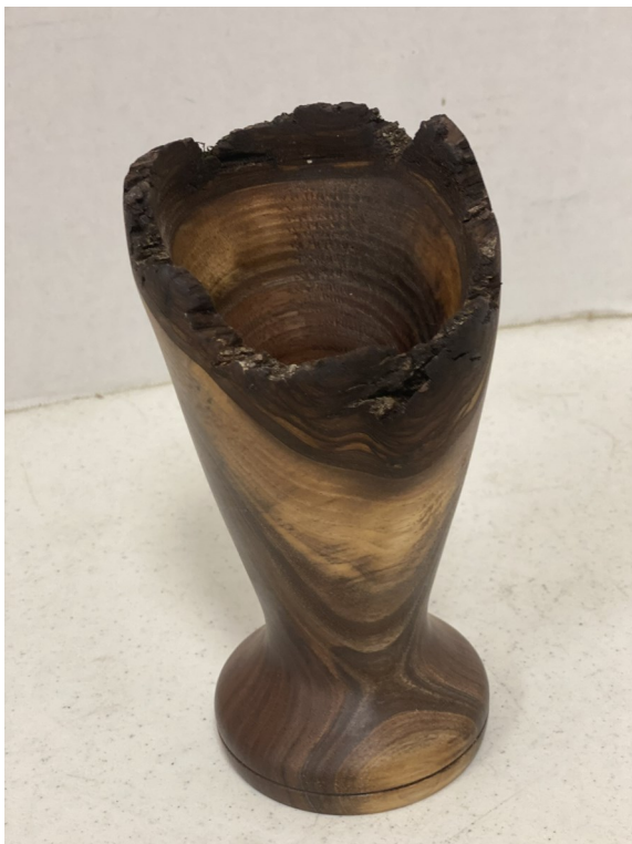
Linda Moore—Walnut vase with live edge. Finish is Danish oil and carnauba wax.