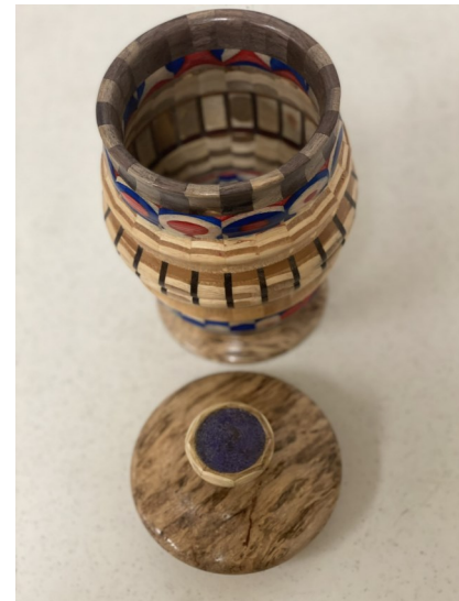
Dallas Hensley—Segmented container made from Walnut, Plywood, Spectra pen cutoffs and spalted Hackberry. 280 pieces in total. Finish is lacquer and then polished.