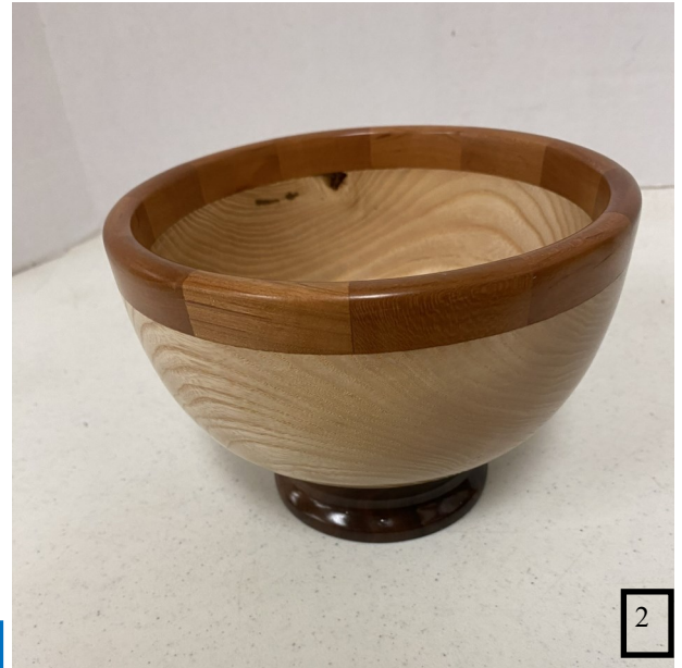
Jerry Hankins—1) Segmented Cherry bowl; 2) Ash bowl with Segmented rim made from Walnut and Cherry base is Walnut; 3) Walnut bowl with Maple rim and rope enhancement. Finish is 4 coats of lacquer.