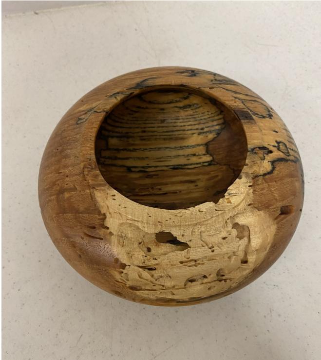
Faith Worden—Spalted Hackberry hollow form. Finish is linseed oil.