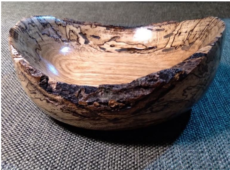
Ray Peacy—Pecan natural edge bowl. Finish is 4-5 coats of tongue oil.