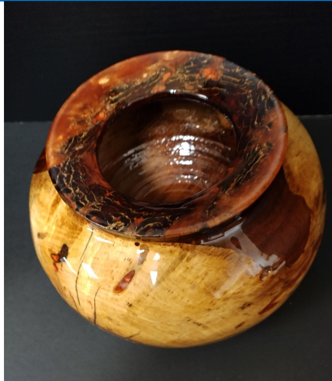
Rex Guynn—Pecan hallow form with a clear coat resin finish.