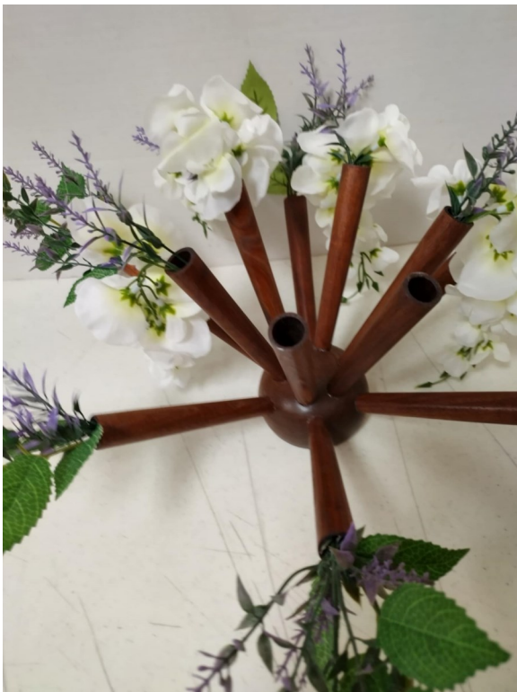
Bill Dorzok—Floral center piece made from Walnut with a poly finish. A ring bowl featuring Birdseye Maple. Finish is wipe on poly—5 to 6 coats.