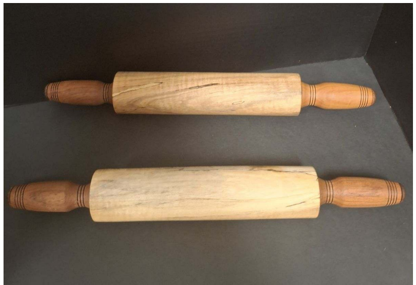
Phil Wiles—Rolling pins made from Maple, Mahogany, and Walnut. Donated for OWT table at Craft Fest.