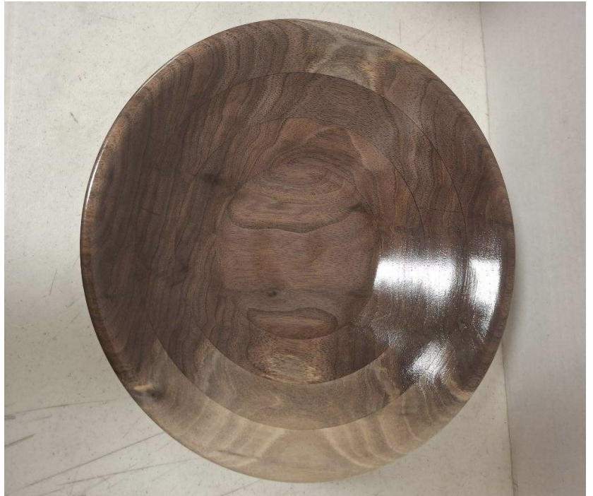
Walley Burr—Walnut ring bowl. Donated for OWT table at Craft Fest.