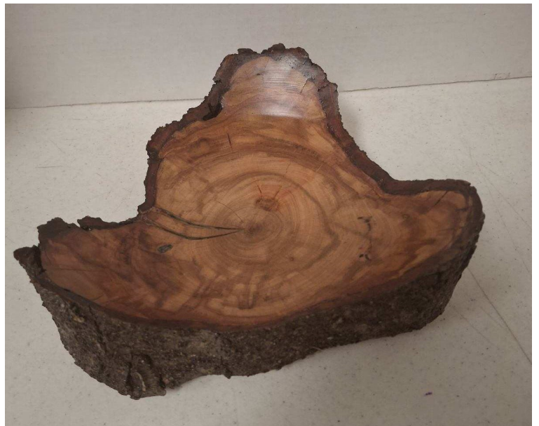
Bill Dorzok—Open segmented live edge valet made from plum. Finish is wipe on poly.