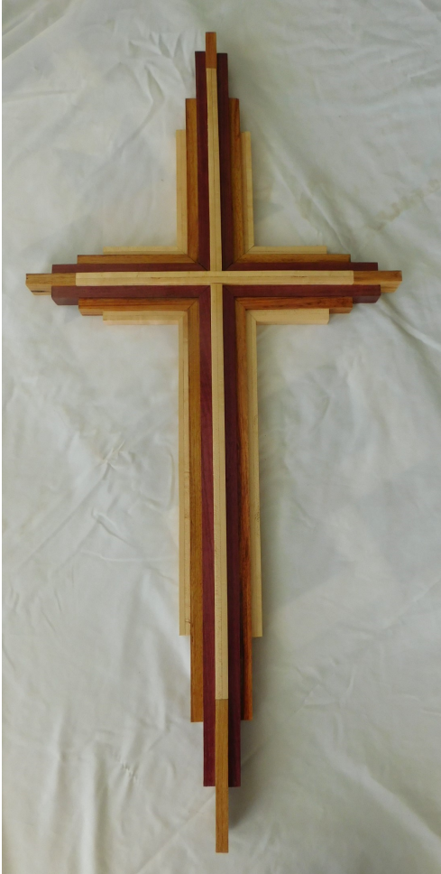
Jeff Smith—36 inch Cross made out of curly maple, canary and purpleheart.