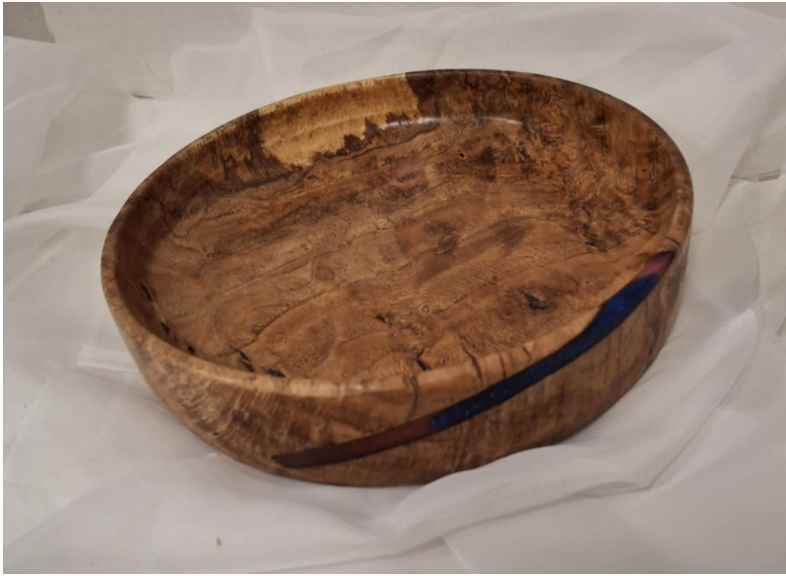
Jay Dukes—Salt & Pepper grinders out of Cherry with Walnut oil and 6 coats of lacquer. The Oak burl bowl presented many challenges with multiple ins and outs of the pressure pot. Finish is Walnut oil and lacquer.