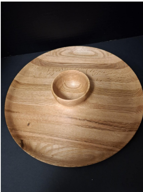
Terry Butler—He took an old kitchen table that was laminated oak and created a chip and dip platter. The finish is bees wax and mineral oil.